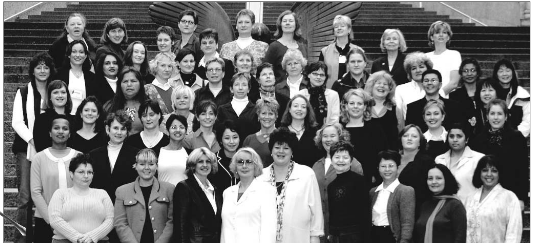
2004 Women's Campaign School class photo.